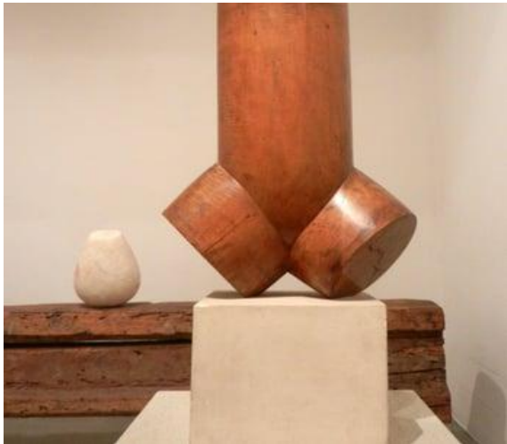
TORSO OF A YOUNG MAN

Other important works are.....THE SORCERESS, SLEEPING MUSE, HEAD OF THE FIRST STEP, NEW BORN, ENDLESS COLUMN ETC.