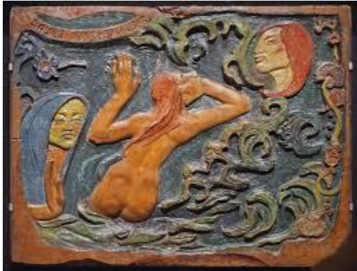
BE MYSTERIOUS WOMAN