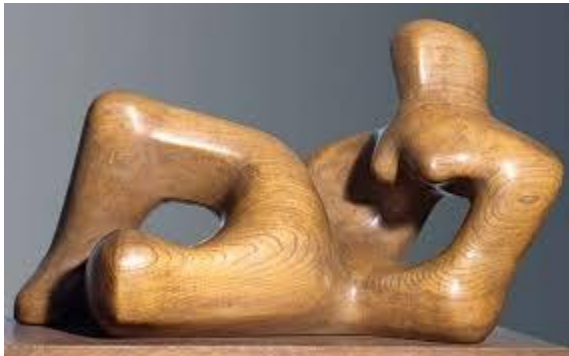
MOTHER AND CHILD

The other important works are.....TWO FORMS, COMPOSITION AND MANY RECLINING FIGURES.