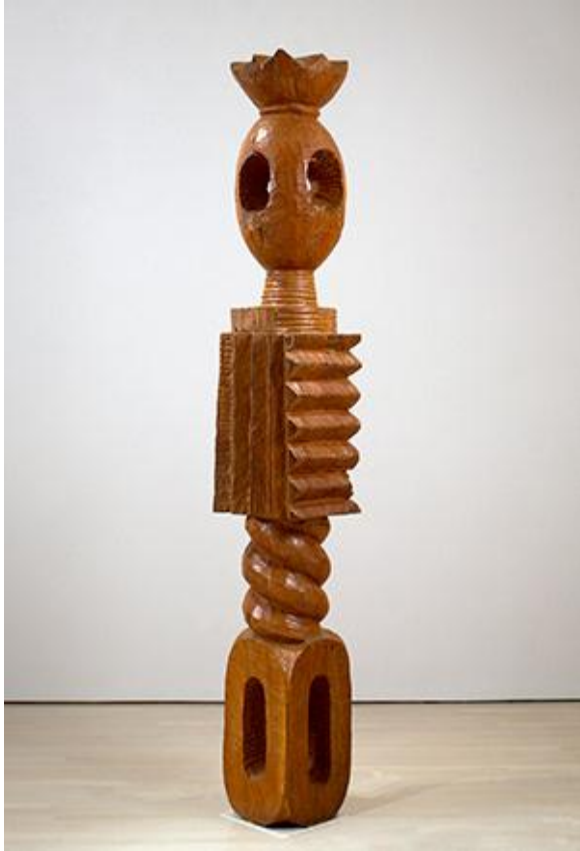
KING OF KINGS