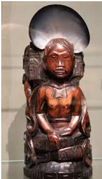
IDOL WITH A SHELL

The other important works are.....TAHITIAN GIRL, THERESSE, MASK OF TEHA-AMANA , BUST and many tahitian girls sculptures.